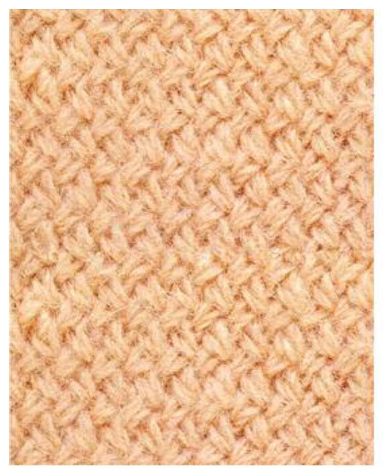
Abb. K1B = knit 1 through back loop

Row 2: K1, *skip 1, p 1 - do not drop, p skipped st, drop both from needle; rep from *, end k1.