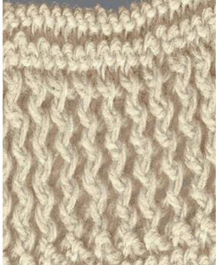
basket weave variant