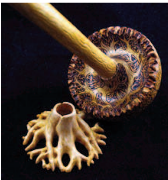
Carved Tree Drop Spindle—David Armstrong

Carla believes that anyone can achieve their goals if they set their minds and determination to it. A Needle Pulling Thread is a magazine that reflects this with every fibre artist she brings together in every inspiring issue. The magazine also reflects that...well...life is just better with needlework!