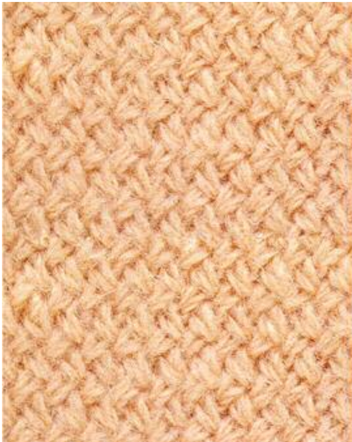
original basket weave