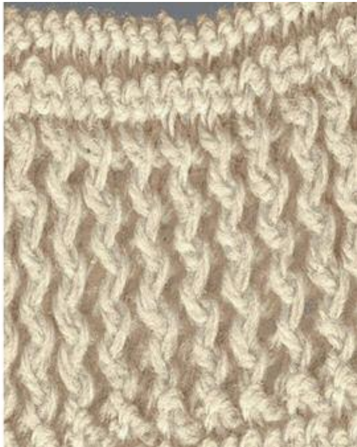
basket weave variant